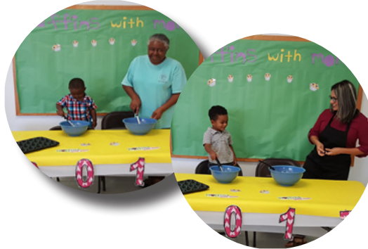
On September 15th students invited their moms and female figures to their center to participate in our Muffins with Mom, family engagement activity.

(Pictured Below)- A Seminole CDC student & father posed for a photo after their family engagement activities.