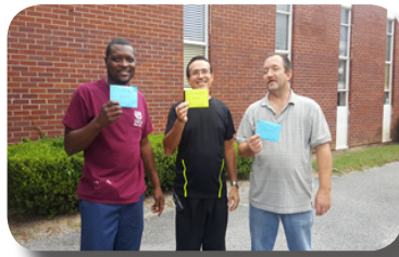
Culbertson CDC Staff showed their appreciation for their custodial staff on National Custodial Worker's Day, October 2nd.